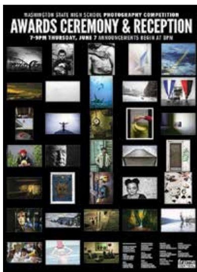
A poster for the awards ceremony created by Frame Central and given to the student exhibitors.