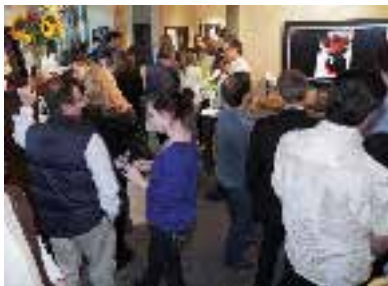
Frame Central hosts a huge crowd on opening night. Guests enjoyed refreshments compliments of Jones Soda.