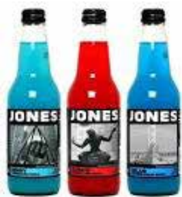
Jones Soda selects six photos from our exhibit for 250,000 of their bottles!