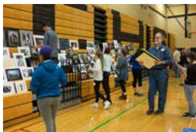
Volunteers quickly set up a category for judges to view at the Inglemoor H.S. gym.