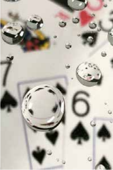
Chiawana H.S. 1st place CAMERA PHONE

A photograph of a person or group of people.