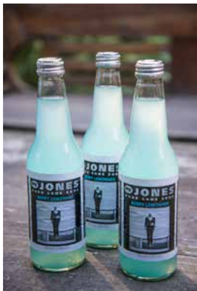
Jones Soda selects six images from our exhibit each year and features them on 250,000 bottles of their soda.