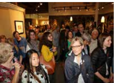
The unruly crowd at the awards ceremony.