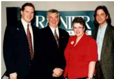
Governor Mike Lowry with sponsors at the Seattle Art Museum awards ceremony in 1996.