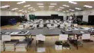
In 2018, our volunteers processed and sorted four thousand entries from sixty-six high schools in a single day.