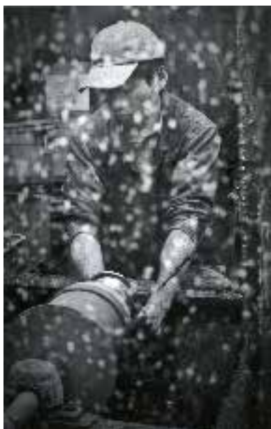
Peninsula High School 2009 Best in Show